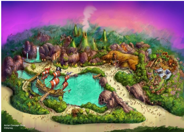
Peter Pan's Never Land (daytime)

In Peter Pan's Never Land , where the world of the Disney Animation film Peter Pan unfolds, guests become a member of the Lost Kids, a group of fun-loving, adventurous and energetic children. Here, guests can explore a pirate ship, dine in a secret hideaway, confront pirates with their friends and enjoy great adventures in Never Land. They can also visit Pixie Hollow, the fairy valley where Tinker Bell lives.