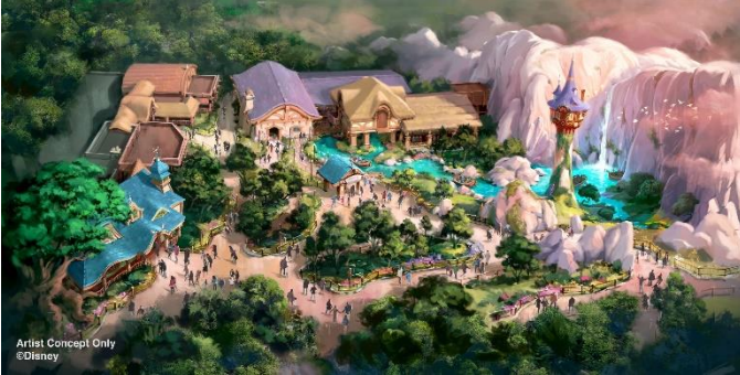
Rapunzel's Forest (daytime)

Rapunzel's Forest brings to life the world of the Disney Animation film Tangled . In the valley rises the tower where the long-haired princess Rapunzel has lived since she was a child. At night, the entire forest is bathed in warm light emanating from Rapunzel's tower, lamps lining the paths, glowing restaurant and boathouse windows and lanterns hanging from the boats.