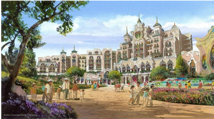
Tokyo DisneySea Fantasy Springs Hotel Exterior view from inside the Park (daytime)

Tokyo DisneySea Fantasy Springs Hotel will be the sixth Disney hotel in Japan, and will be situated near the magical spring in Fantasy Springs . Paintings depicting Disney Princesses as well as floral motifs can be seen throughout the interior of the hotel, allowing the world of Fantasy Springs to continue from the Park to the hotel. The hotel is comprised of 419 “deluxe-type” rooms. In addition, there are 56 “luxury-type” rooms, offering guests the finest accommodation experience at Tokyo Disney Resort.