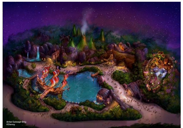
Peter Pan's Never Land (nighttime)