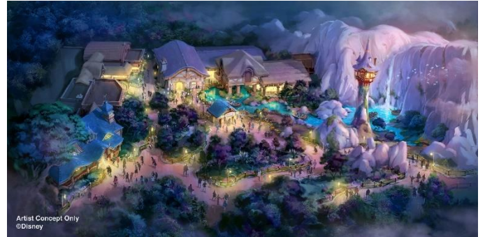
Rapunzel's Forest (nighttime)